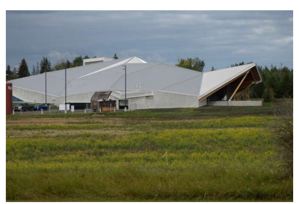
Visit the Philip J. Currie Dinosaur Museum