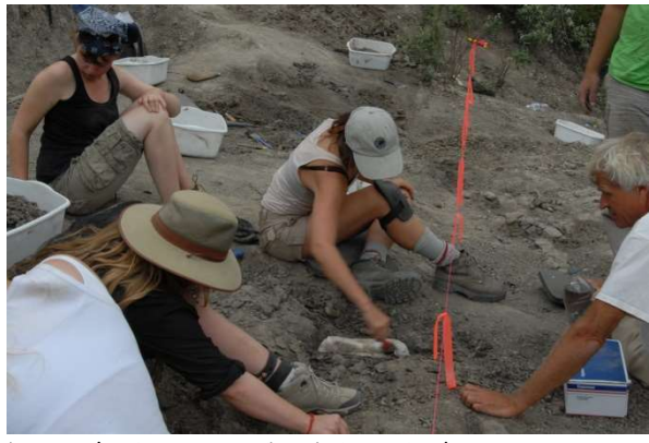
Dig in the Pipestone Creek Bone Bed.